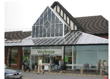
The Waitrose store in Sandbach