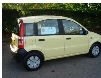
Team Picture Person A, B, C, D etc

emergency calls that come from the 999 Emergency Medical Despatch Centre, and are paged or phoned at the